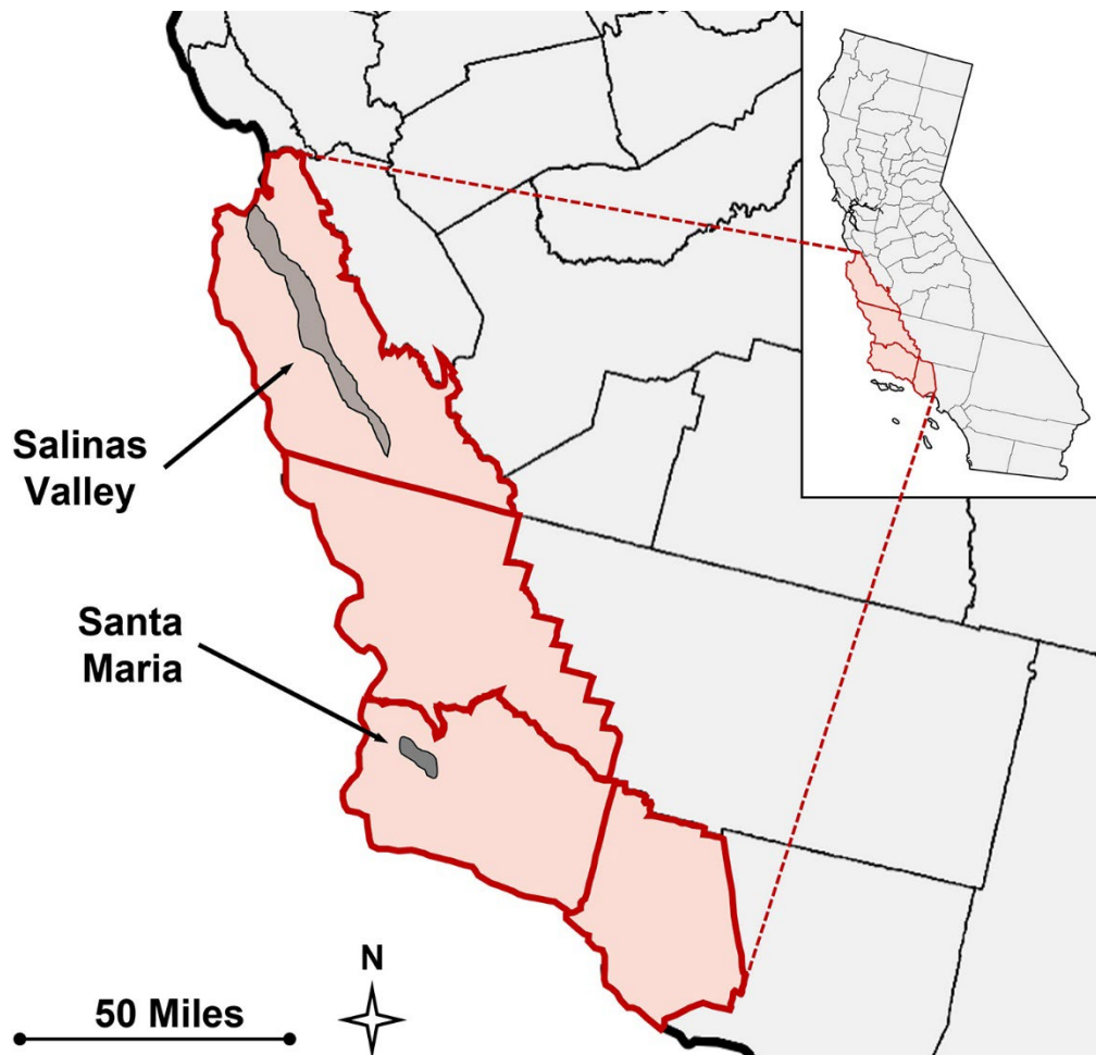
Appendix 2 Figure. Map illustrating growing regions in California, USA, of which some REPEHX02-linked illnesses are associated with. More specifically, outbreak A in this study was traced to romaine lettuce from Salinas Valley, California, while traceback and sampling in outbreak B2 linked some illnesses to romaine lettuce from Santa Maria, California, both labeled and shaded in grey on the map.