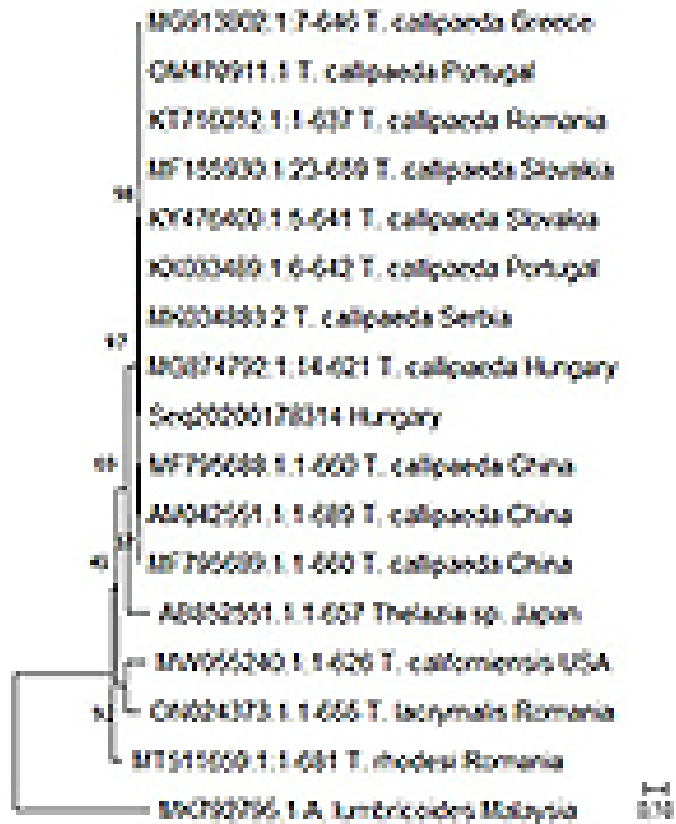
Appendix Figure 1. Maximum-likelihood tree shows the relationships between cox1 sequences in the case of our isolate (Seq20200178314) and other Thelazia spp. retrieved from GenBank. A. lumbricoides is designated as an outgroup.