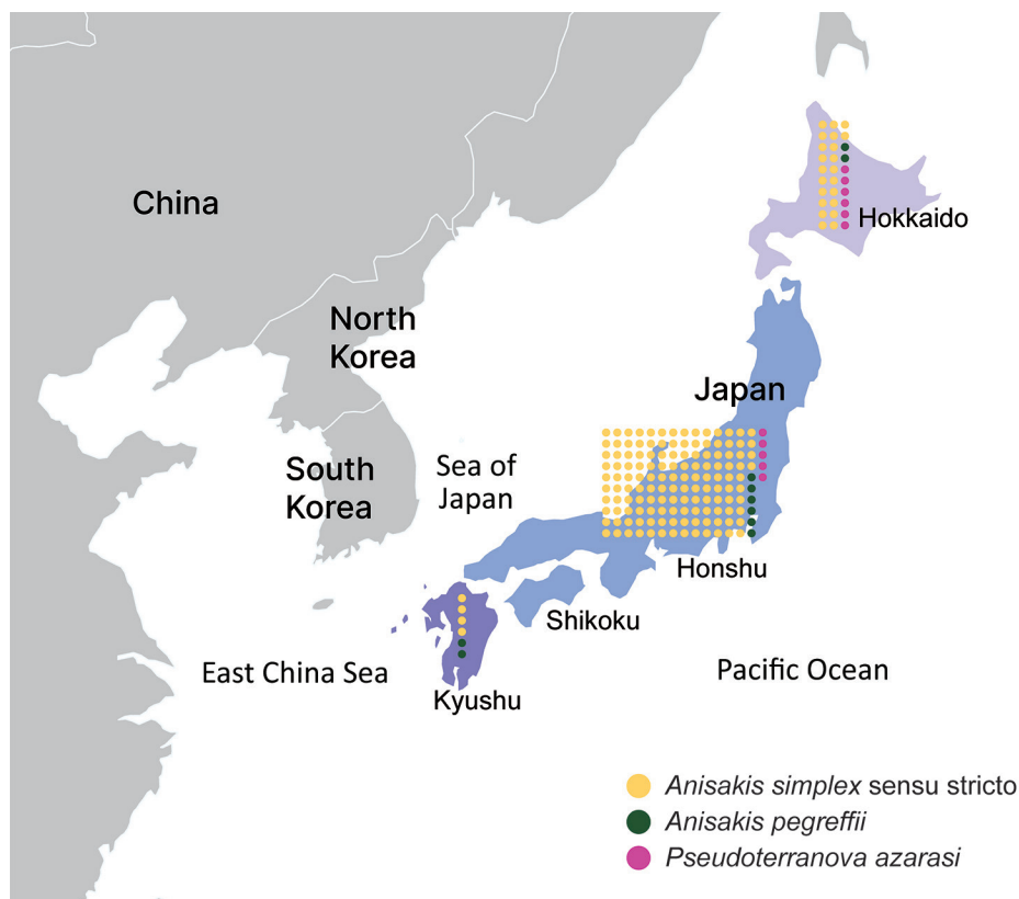
Figure 1. Anisakiasis patient number and causative species analyzed in study of anisakiasis in Japan, 2018–2019. Three geographic locations in Japan are noted: Hokkaido Island (North Japan), Honshu and Shikoku Islands (Central Japan), and Kyushu Island (Southwest Japan). Each dot indicates 1 patient, and color indicates the anisakiasis-causing species. Identifications were made at the sibling species level by using PCR and sequencing.

A recent study estimated 7,700–8,320 annual anisakiasis cases in Spain, a country with a high incidence of anisakiasis in Europe (10). Although our survey methods differed, we demonstrated that Japan had an average of 19,737 anisakiasis cases per year during 2018–2019. As preventive measures, the government of Japan has repeatedly instructed local establishments (e.g., restaurants, fish mongers, and grocery stores) and consumers to freeze seafood at -20^{\circ}\text{C} for at least 24 hours before consuming it raw or