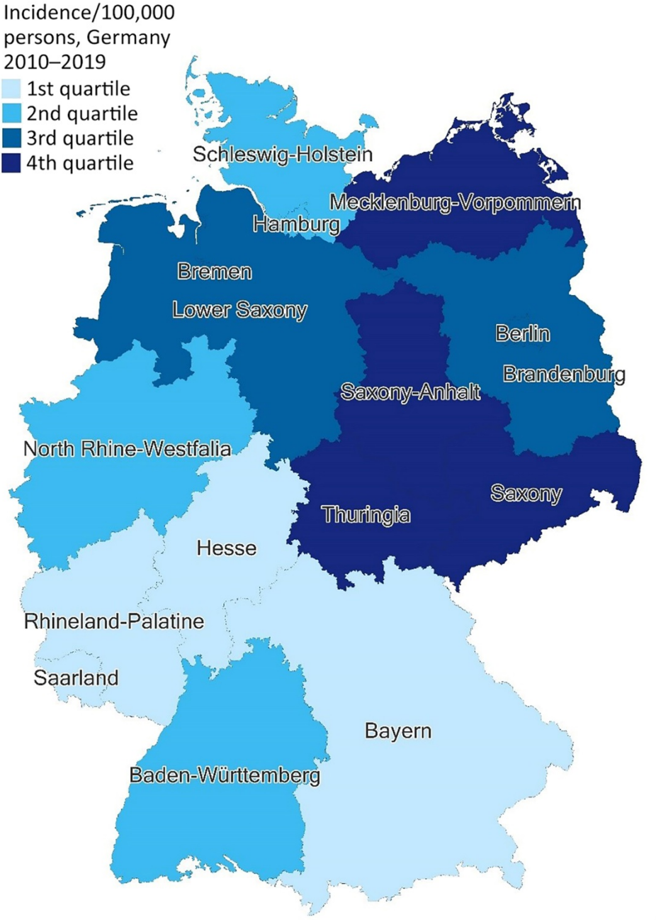
Appendix Figure. Spatial distribution of average annual incidence of pregnancy-associated and non-pregnancy associated listeriosis in federal states, Germany, 2010–2019 (n = 5,575)