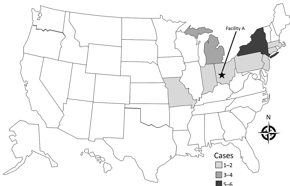
Figure 1. Outbreak-related cases of listeriosis (n = 19) in the United States by state of residence, July 5, 2015–January 31, 2016.

On January 14, 2016, PulseNet staff analyzed sequence data from L. monocytogenes isolated from a packaged leafy green salad that was collected by ODA during routine retail sampling and found that it was closely related by wgMLST to clinical isolates from case-patients (median 3 alleles, range 0–16 alleles). On the basis of these laboratory results, in combination with preliminary epidemiologic data suggesting a link to leafy green salads, on January 16, 2016, FDA initiated an inspection of the facility that processed the packaged leafy green salad.