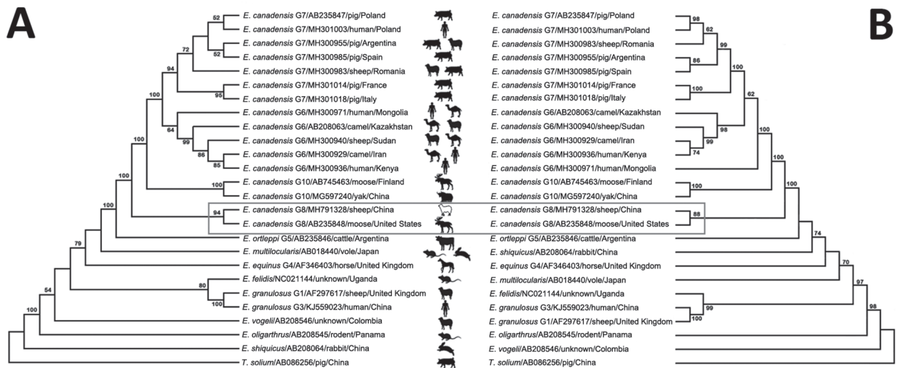
Figure. Phylogenetic analysis of Echinococcus species of different genotypes, strains, and host origins, including the E. canadensis G8 tapeworm identified in a sheep in China, 2018. Phylogenetic trees were inferred by maximum-likelihood analysis on the basis of concatenated amino acid data of 12 protein-coding genes by using the Jones-Taylor-Thornton model (A) and concatenated nucleotide data of 12 protein-coding genes by using the Tamura-Nei model (B) in MEGA7.0 ( https://www.megasoftware.net ). The reference species Taenia solium was used as the outgroup. We performed bootstrapping with 1,000 replicates to calculate the percentage reliability for each node in both data sets; only values of \geq 50\% are shown. Tree branch lengths are proportional to the evolutionary distance. The box contains the E. canadensis G8 tapeworm identified in this study (GenBank accession no. MH791328) and its closest relative from a moose in the United States (GenBank accession no. AB235848). Sheep shown in white represents a potential new intermediate host of E. canadensis G8.