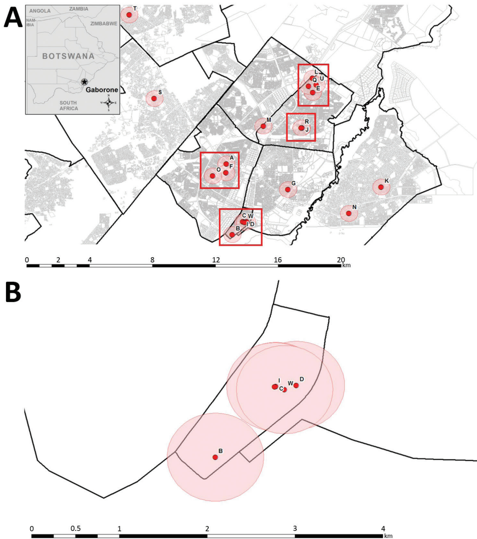
Figure 2. Residence-associated data for patients in a tuberculosis cluster, Gaborone, Botswana, 2012–2015. A) Primary residences of 20 patients are indicated by red dots. Inset map shows location of Gaborone in Botswana. Black lines demarcate neighborhoods; gray lines demarcate property parcels; pink circles represent 0.5-km radius around a patient’s residence; and red rectangles indicate presence of 14 patients in 4 distinct neighborhoods, 13 of whom had spatial links. Four patients who are not depicted on this map lived outside of Gaborone and did not have any spatial links between them. B) Primary residences of 5 patients who lived in the same neighborhood. Parcels locations were intentionally not shown to protect individual case anonymity. Geodata were sourced from Statistics Botswana ( http://www.cso.gov.bw ).

Second, underreporting of locations might have occurred due to patients’ inability to remember all locations visited; thus, some less frequented places where transmission might have occurred may have been missed. Third, we could not prove that patients who attended the same location interacted with each other at that location while infectious. Fourth, if a cluster-associated patient went to the hospital as a visitor, not a patient, their overlap with another cluster-associated patient could have been missed. Fifth, the extent to which the hospital infection-control program influenced our findings is unknown. Sixth, because 24-locus mycobacterial interspersed repetitive units–variable number tandem repeats characterizes only a portion of the M. tuberculosis genome, it is possible for 2 different strains to appear similar. Whole-genome sequencing could help confirm (or refute) the findings in this investigation.