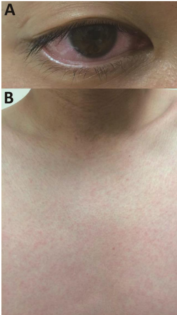
Technical Appendix Figure. Congested bulbar conjunctivas and maculopapular rash on patient's trunk. A) Congestion of bulbar conjunctivas resolved after a few days. B) Maculopapular rash with pruritus spread from the trunk to the extremities.