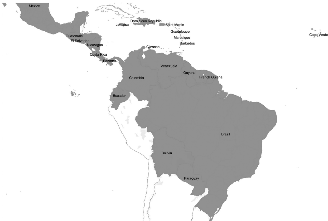
Figure 3. South America, Central America, and Caribbean countries and regions reporting laboratory-confirmed autochthonous Zika virus disease cases during January 1, 2015–February 10, 2016 (online Technical Appendix Table 2, http://wwwnc.cdc.gov/EID/article/22/7/15-1990-Techapp1.pdf ). Data represent outbreaks and case reports for all reported autochthonous laboratory-confirmed cases of Zika virus infection in these countries and regions during January 1, 2015–February 10, 2016, including those reported in peer-reviewed literature; public health agency Web sites, bulletins, and broadcasts; and media reports.

exposure to mosquitoes (40); no definitive mechanism for transmission was described for either patient.