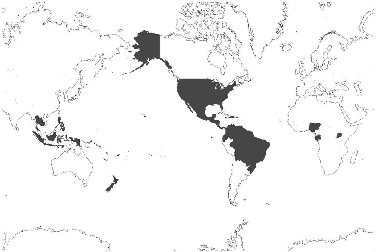
Figure 2. All countries and regions reporting laboratory-confirmed autochthonous Zika virus cases, January 1, 2015–February 10, 2016 (online Technical Appendix Table 2, http://wwwnc.cdc.gov/EID/article/22/7/15-1990-Techapp1.pdf ). Data represent outbreaks and case reports for all reported autochthonous laboratory-confirmed cases of Zika virus infection, including those reported in the peer-reviewed literature; public health agency Web sites, bulletins, and broadcasts; and media reports for selected dates.

Ae. aegypti mosquitoes, which laboratory experiments have shown to be capable of transmitting Zika virus (26,27). Ae. hensilli mosquitoes were implicated in the Yap outbreak, yet Zika virus has never been isolated from these mosquitoes (28,29). In Africa, the predominant Aedes species vector has not been definitively identified, although viral isolation studies suggest that Ae. albopictus was the likely vector in a 2007 Zika virus outbreak in Gabon (23).