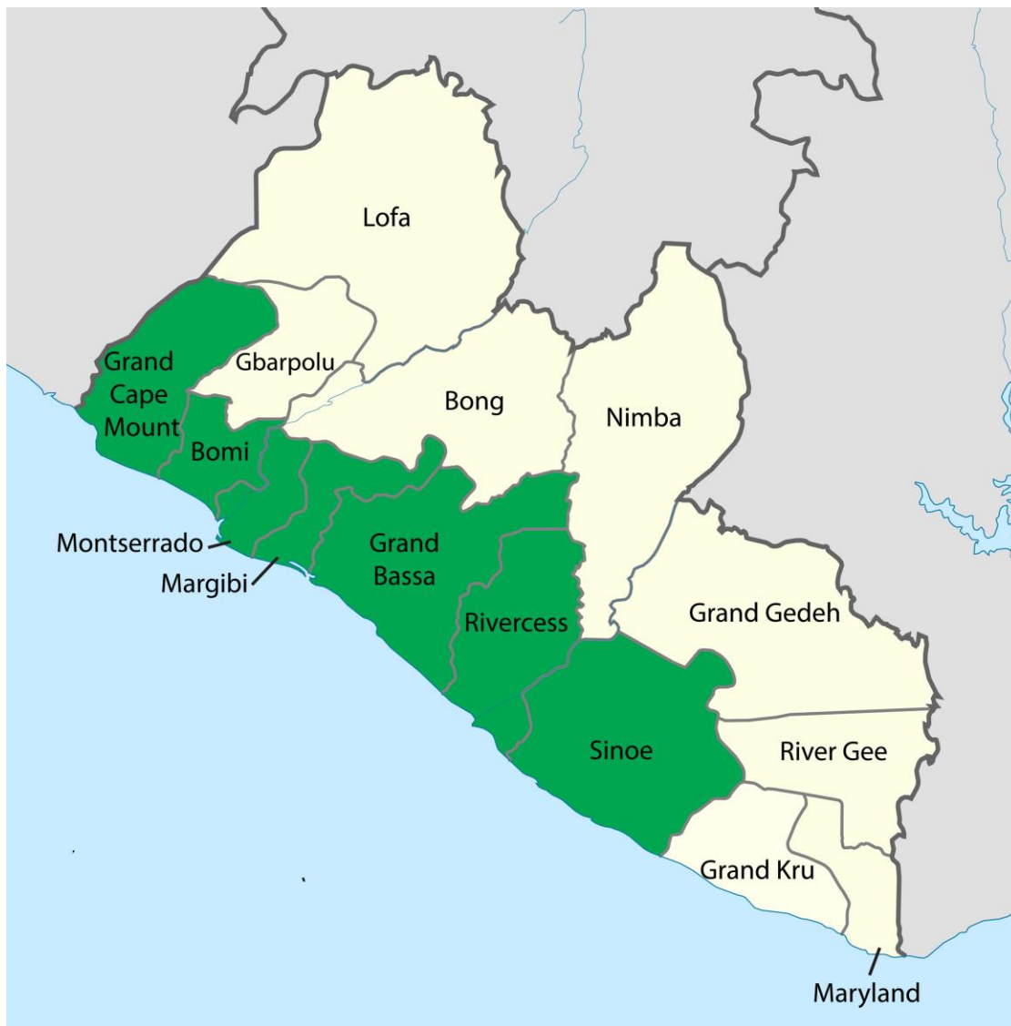
Technical Appendix 1 Figure 1. Map of Liberia counties showing the 25 Ebola virus (EBOV) isolates described in this study. Samples were collected from persons in 7 coastal Liberian counties (highlighted in green) during September 2014–February 2015.