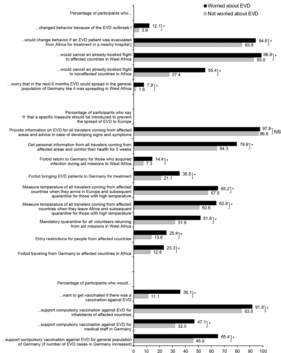
Figure. Personal behavior and attitudes toward measures against the spread of Ebola virus disease (EVD) and toward vaccination against EVD. Black, worried about EVD; gray, not worried about EVD; NS, not significant. * \chi^2 test p < 0.05 . †“Yes” to at least 1 of 5 items (avoid contact with African acquaintances; avoid contact with African persons in public places; avoid going to public events; avoid using public transportation; engage in precautionary purchases). ‡“Yes” to at least 1 of 7 items (avoid public events/crowded places; avoid using public transportation; avoid physical contact with other persons; increase hygiene behavior; wear face mask outside of the home; avoid admission to the same hospital; avoid visiting friends admitted to the same hospital).

with 9.4% of those who did not consider airborne transmission as being possible ( p = 0.001 ). Education was positively associated with knowledge scores about Ebola virus transmission routes (Spearman correlation coefficient 0.18, p < 0.001 ) and rating of personal knowledge about EVD (Spearman correlation coefficient 0.39, p < 0.001 ). After controlling for the rating of personal knowledge about EVD, education was no longer associated with the score for knowledge about Ebola virus transmission routes (partial correlation coefficient -0.003 , p = 0.91 ).