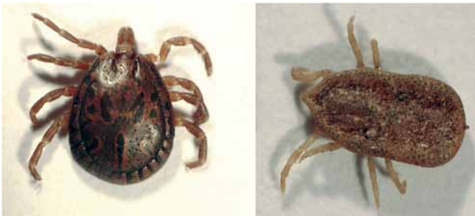
Figure 2. Amblyomma loculosum (left) and Carios capensis (right) ticks from seabird colonies on western Indian Ocean islands.

Partial sequencing was performed on the Rickettsia spp. gltA gene from 60 ticks, including ticks from each island and both species. Phylogenetic analyses revealed 7 haplotypes clustering in 4 well-supported clades; some of the haplotypes corresponded to previously described species (Figure 3). No association was found between Rickettsia spp. and collection location (island), but strong host (tick) specificity was observed (Figure 3). All A. loculosum ticks were infected with a Rickettsia strain showing 100% nt identity with the R. africae strain infecting A. loculosum ticks in New Caledonia and with the ESF-5 strain isolated from the cattle tick, A. variegatum , in Ethiopia (GenBank accession no. CP001612.1). Rickettsia spp. in C. capensis ticks had 3 well-supported genetic clusters and, thus, were more diverse. The most frequent Rickettsia sp. in these ticks (64% of the sequences) was a probable strain of R. hoogstraalii . Other haplotypes corresponded to an unknown Rickettsia sp. that was closely related to R. hoogstraalii and to a probable strain of R. bellii (28% and 8% of the sequences, respectively). The haplotype of R. bellii was detected only on Réunion Island in 2 C. capensis ticks collected within the same nest of the wedge-tailed shearwater ( Puffinus pacificus ).