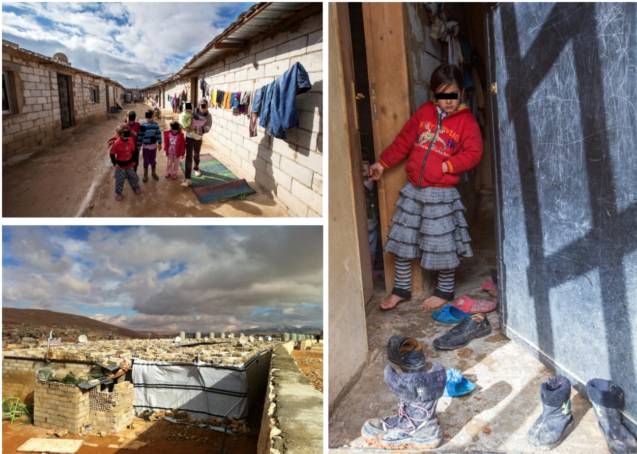
Technical Appendix Figure. Syrian refugees in temporary, unsanitary, resource-poor settlements, which are breeding grounds for disease and disease vectors, Beirut, Lebanon, 2012.