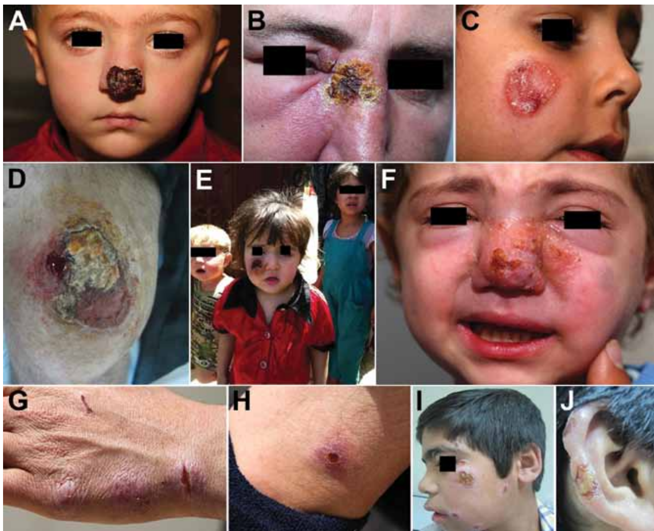
Figure 2. Patterns of leishmaniasis among Syrian refugees in Lebanon, 2012. A, B) Lesions impinging and possibly hindering the function of vital sensory organs, including the nose and eyes. C, D) Lesions >5 cm. E, F) Lesions disfiguring the face. G, H) Special forms of cutaneous leishmaniasis; shown here is a patient with spread and satellite lesions on the hand and arm. I, J) Patient with 15 lesions.

team reported no cases in Lebanon during 2004–2008, compared with 22,882 cases in Syria during the same period (14). Furthermore, 85% of cases studied were caused by L. tropica , a species endemic to the Aleppo region in Syria. This finding might explain why most of the patients we encountered had aggressive (large, multiple, and disfiguring facial lesions) and prolonged disease courses necessitating treatment with intramuscular rather than intralesional medication. Local collaboration, early detection, and diagnosis, along with speciation of the parasite, were of paramount importance to ensure the effective delivery of treatment and successful control of the epidemic.