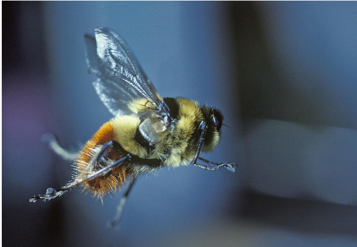
Technical Appendix Figure 1. Female Hypoderma tarandi reindeer warble fly in flight. The parasite can fly for many hours and may cover 600–900 km during its lifetime. This flight capacity has evolved to find reindeers. They do not feed as adults.