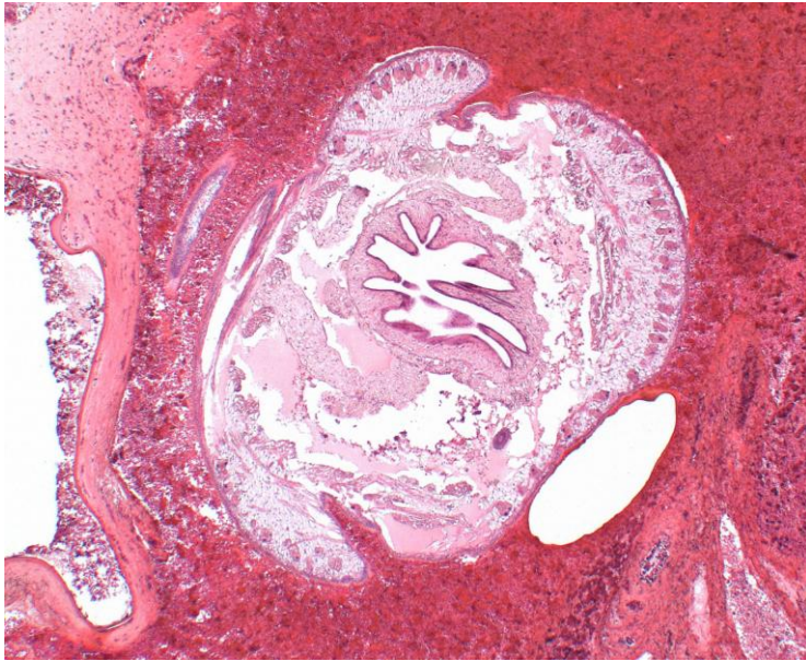
Figure. Transverse section of an Armillifer armillatus larva from the liver of the patient (immigrant) from Togo. Typical for pentastomid lesions, the parenchyma shows focal hemorrhage around the parasite and no inflammatory cellular reaction (1). There is also focal destruction of the trabecular liver parenchyma. Subcuticular gland cells of the parasite are visible, and the intestine is clearly discernable in the center (hematoxylin and eosin stain, original magnification \times 20 ).