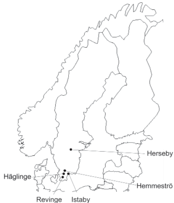
Figure 1. Collection locations for rodents and shrews tested for Candidatus Neoehrlichia mikurensis and Bartonella spp. infections, southern Sweden, 2008. Prevalence of infection: Häglinge, n = 45 infections, 0% Candidatus N. mikurensis , 44.4% Bartonella spp.; Revinge, n = 623 infections, 9.3% Candidatus N. mikurensis , 33.7% Bartonella spp.; Istaby, n = 53 infections, 3.8% Candidatus N. mikurensis , 34% Bartonella spp.; Hemmeströ, n = 64 infections, 4.7% Candidatus N. mikurensis , 39.1% Bartonella spp.; Herseby, n = 49 infections, 12.5% Candidatus N. mikurensis , 45.0% Bartonella spp.

All amplified fragments were sequenced, and a BLAST ( http://blast.ncbi.nlm.nih.gov/Blast.cgi ) search showed that 68 animals were infected by Candidatus N. mikurensis . The primers were chosen to be specific for bacteria belonging to the families Rickettsiaceae and Anaplasmataceae (10), but