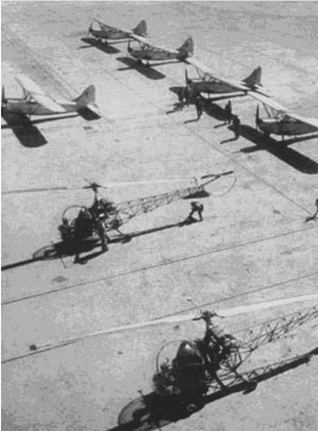
Figure 4. Aerial spraying of DDT in Sardinia, 1948.

this study argued that expansion of the cohort and collection of information are needed to clarify these findings. No studies of the environmental effects have been conducted.