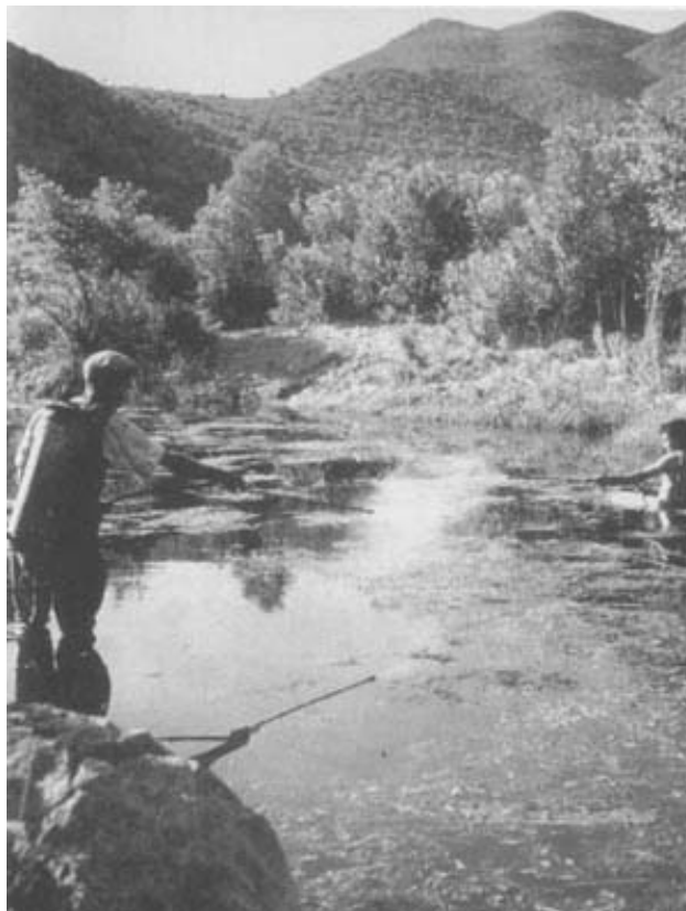
Figure 3. Larviciding.

The widespread use of DDT was not required, considering the potential negative effect on the environment