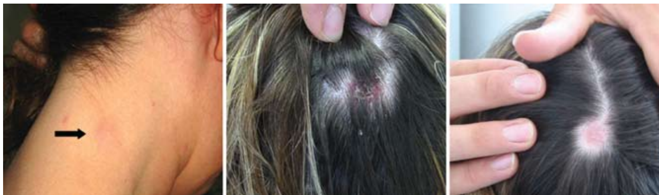
Figure 2. Typical signs of TIBOLA (tick-borne lymphadenopathy)/DEBONEL ( Dermacentor -borne necrosis erythema and lymphadenophy). Here, infections were caused by Rickettsia slovaca , resulting in cervical lymphadenopathy (left panel, arrow), inoculation on the scalp (middle panel), and residual alopecia 4 weeks later (right panel).

lung cells (6). These samples were also used to amplify and identify outer membrane protein A–encoding gene fragments of rickettsiae by PCR (3). Also, the so-called suicide PCR-assay was used with acute-phase serum samples (1).