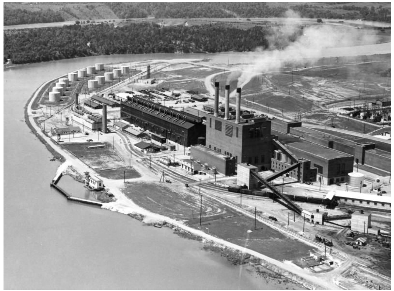
Figure 2-1. S-50 plant (left of power plant for K-25) and auxiliary buildings (Fandom 2019).

The S-50 plant was originally intended to supply high concentrations of <sup>235</sup>U feed to the Y-12 Plant until the gaseous diffusion process at K-25 could get into large-scale production (Author unknown ca. 1947). However, in June 1945 S-50 feed material was first fed to K-25 instead of Y-12 (Author unknown ca. 1947). There was a tremendous amount of emphasis placed on high production output at this facility. Processed uranium from the plant was eventually used as feed material for the Y-12 facility, where it was further enriched; some of this material was used in the bomb dropped over Hiroshima ("Little Boy"). Operations at S-50 generally continued around the clock. The number of individuals Fercleve employed reached a maximum of 1,600 in April 1945 (MED 1947).