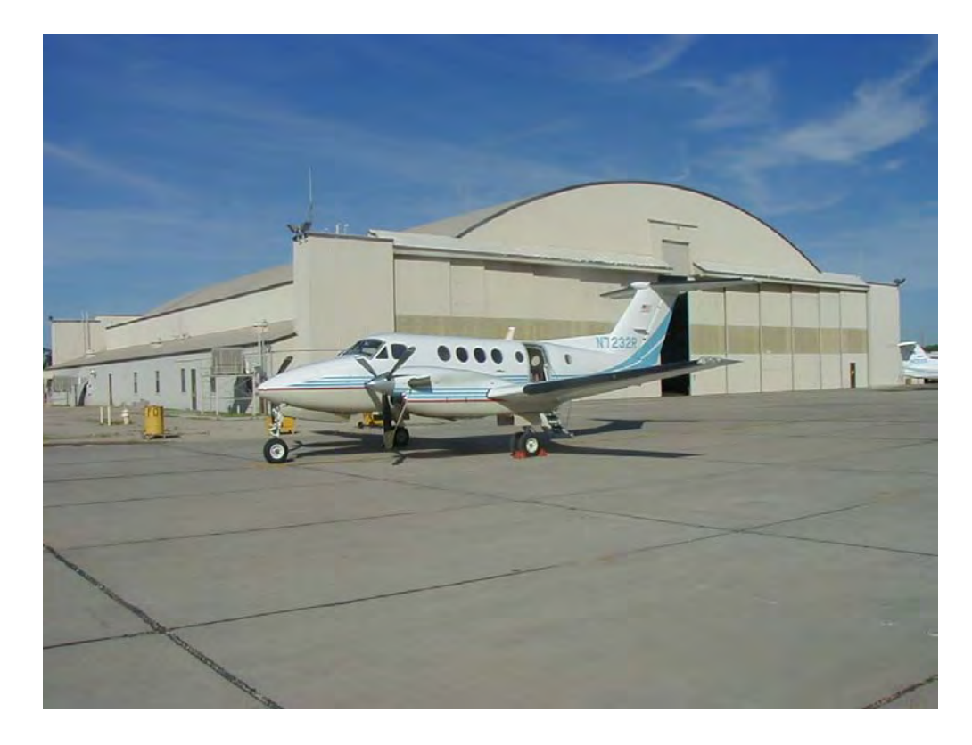
Figure 5-2: Hangar 481, Kirtland Air Force Base

According to the contract (Contract, 1989), the government-owned aircraft that were operated and maintained by Ross Aviation at Kirtland AFB consisted of the following: