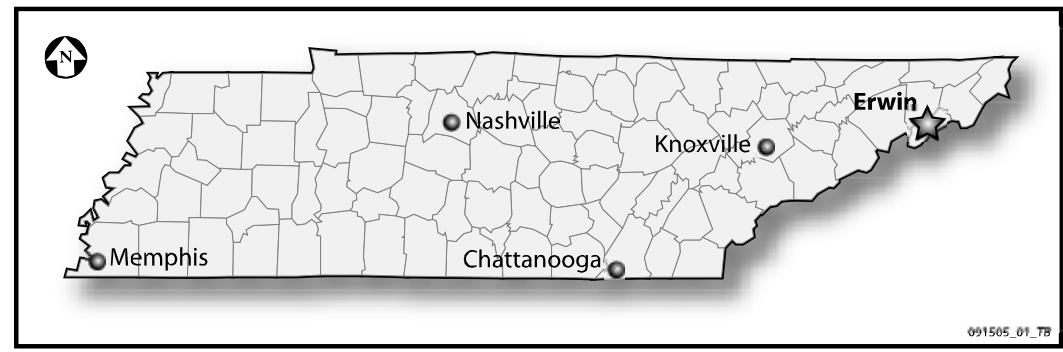
Figure 2-1. Location of Erwin, Tennessee.

facility at one time processed ThO<sub>2</sub> mixed with <sup>233</sup>U to make the light-water breeder reactor fuel for the Shippingport Reactor. Plutonium and DU mixed oxide (MOX) fuel for the South-West Experimental