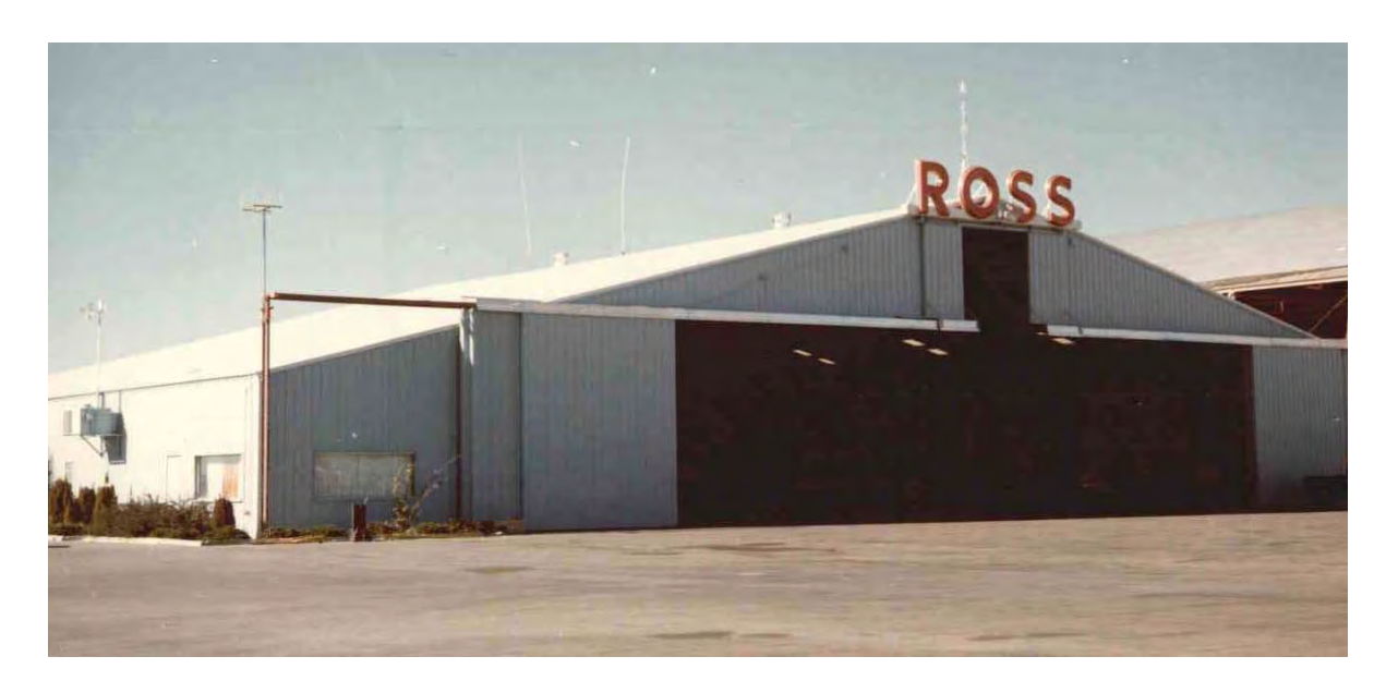
Figure 5-2: Hangar 481, Kirtland Air Force Base

According to the contract (Contract, 1989), the government-owned aircraft that were operated and maintained by Ross Aviation at Kirtland AFB consisted of the following: