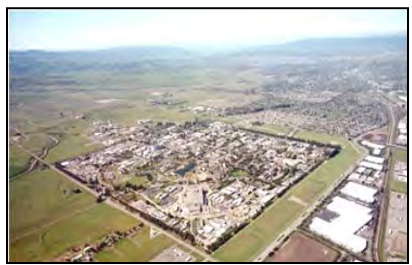
Figure 2-1. Aerial view of LLNL main site (LLNL 2005a).

LLNL was founded in 1952 on the site of a closed U.S. Naval Air Station. It was known originally as the University of California Radiation Laboratory at Livermore then later as the Lawrence Radiation Laboratory at Livermore. LLNL consists of two sites, the main Laboratory site, which is in a densely populated 1.5-mi<sup>2</sup> area in Livermore, California (Figure 2-1), and the 11-mi<sup>2</sup> Explosive Test Site near Tracy, California, which is also known as Site 300.