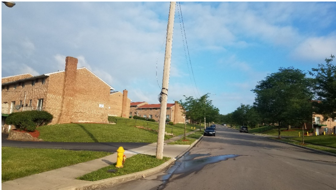
Photo 2. Lighting poles along street