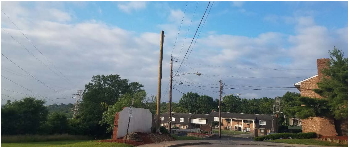
Photo 3. Photo of new camera pole at end of cul-de-sac

NIOSH • 1000 Frederick Lane, Morgantown, WV 26508 • 304-285-5916