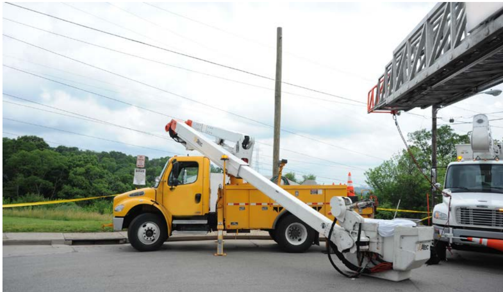
Photo 1. Freightliner M2 Aerial Lift Boom Truck

NIOSH • 1000 Frederick Lane, Morgantown, WV 26508 • 304-285-5916