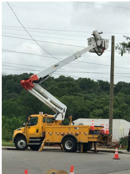
Photo 4. Position of bucket truck in cul-de-sac at the time of the incident