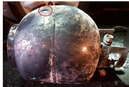
Photo 4: Incident 20-lb. propane cylinder as found inside the stand. A cylinder breach crack was caused by the fire (circled).