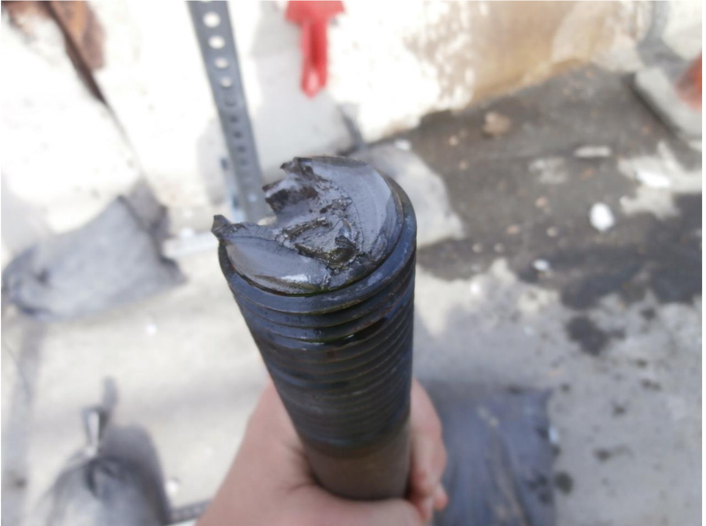
Photo 6. The clamp bolt broken from the vibratory pile driver had metal failure.

Both fixed and movable jaws had two clamp areas with teeth: Each clamp area was approximately 1 inch wide and 7 3 / 4 inches long with 10 teeth (Photos 7 and 8). All four clamping surfaces had worn or broken teeth: The peaks were either broken off or worn flat. The sections that had worn or broken peaks were approximately 4 inches long from the end of the jaws where they gripped the piles. The jaws were mis-aligned in all three dimensions resulting in unparallel gripping surfaces and mis-aligned and partially engaged teeth.