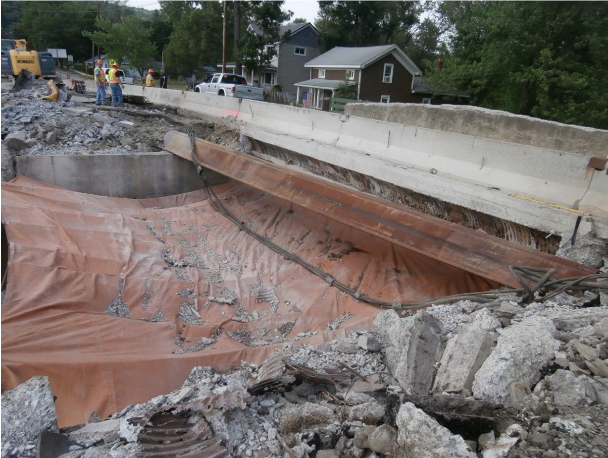
Photo 10. The sheet pile broke from the pile driver, fell and landed on the west side of the bridge (photo courtesy of OSHA).