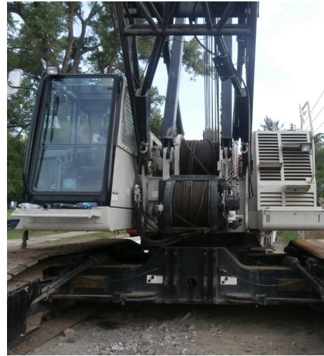
Photo 2. The Link-Belt crane had two winding drums, one for the main hoist rope and the other for the auxiliary hoist rope.