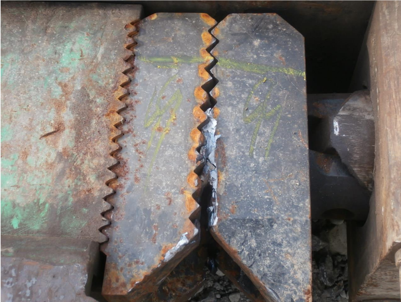
Photo 8: The jaws had worn or broken teeth: the peaks were broken off or worn flat especially in the lower end of the jaws. Part of the sheet pile was still being held by the jaws.

The failures on three clamped areas on the interlocked sheet piles were examined (Photo 9). Each clamped area had two grip marks (left and right). All clamped areas had tooth imprints indicating unevenly worn and partially engaged teeth. For example, the left gripping mark of the first grip showed that the top part of the sheet pile was being crushed and the lower part was ripped or torn off, indicating uneven pressure distribution among gripping teeth.