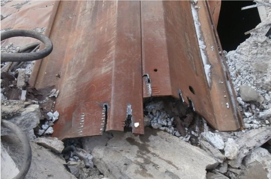
Photo 9. All three gripping areas on the sheet pile had tooth imprints indicating unevenly worn and partially engaged teeth and uneven distribution of pressure (photo courtesy of OSHA).

New York State Department of Health • Bureau of Occupational Health and Injury Prevention Empire State Plaza-Corning Tower, Room 1325 • Albany, NY 12237 • 866-807-2130 www.health.ny.gov/environmental/investigations/face/index.htm