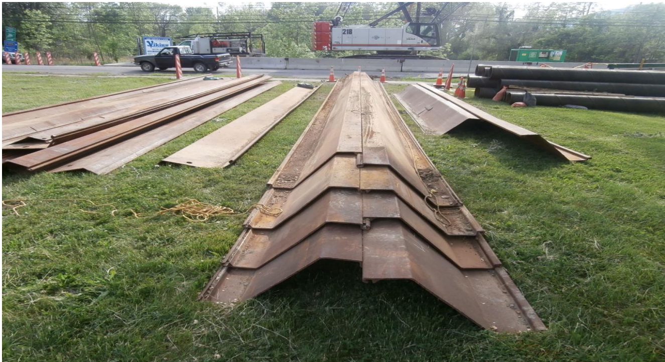
Photo 4. Two piles were interlocked to form a “pair” or “double sheet”. The double-sheet pile were approximately 40 feet long and 4000 pounds in weight.

The construction company was contracted by the New York State Department of Transportation (NYSDOT) to demolish and reconstruct a two-lane bridge on a state route in central NY. The bridge, oriented in a north/south direction, was approximately 47 feet wide and 52 feet long spanning a creek in an east/west orientation. The construction plan was to first demolish one lane of the bridge while keeping the other lane open to traffic. The company was to install steel sheet piles at the existing bridge abutments to reinforce and maintain their structural integrity before excavating and installing new abutments. The project started on May 11, 2015, and the incident occurred on Friday, May 29, 2015, when the pile driving started.