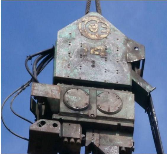
Photo 1. The International Construction Equipment, Inc (ICE) Model 14-23 vibratory driver/extractor that was involved in the incident.

New York State Department of Health • Bureau of Occupational Health and Injury Prevention Empire State Plaza-Corning Tower, Room 1325 • Albany, NY 12237 • 866-807-2130 www.health.ny.gov/environmental/investigations/face/index.htm