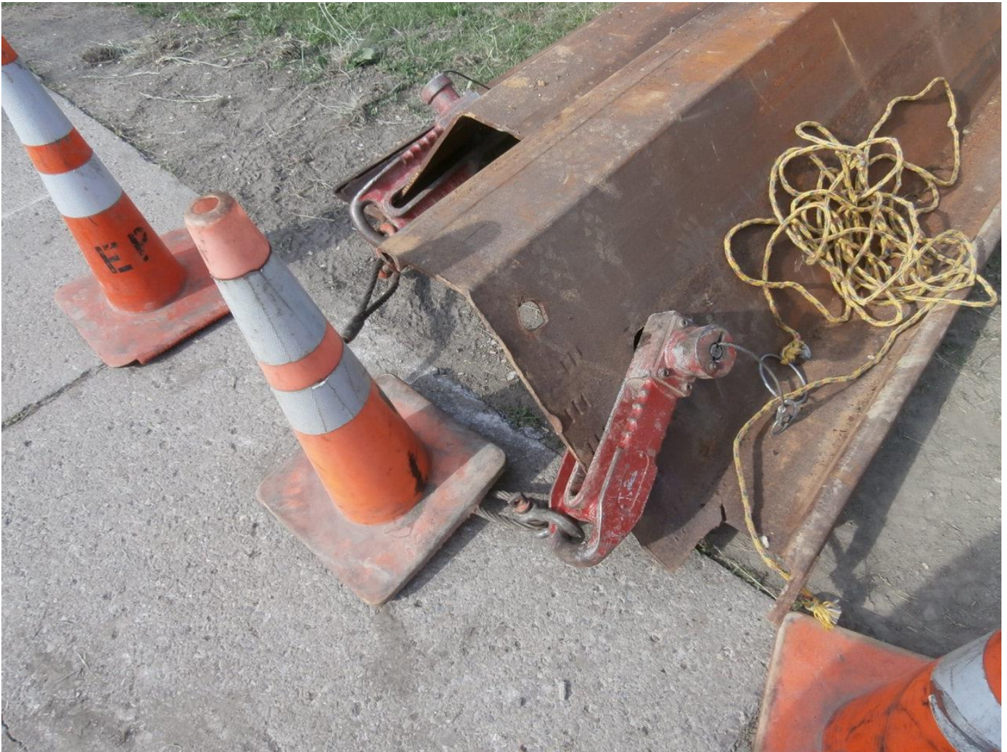
Photo 5. Pile shackles with ground release attached to a pair of sheet pile.

At approximately 11:00 a.m. the traffic lights at both ends malfunctioned. Instead of alternating in red or green cycles, both lights went to flashing yellow simultaneously. The decedent was first directing the traffic at the north end of the bridge. Once the traffic lights malfunctioned, the traffic kept encroaching into the work zone. The foreman sent the decedent to the center of the bridge so that she could better control the traffic (Figure 2. Incident site sketch).