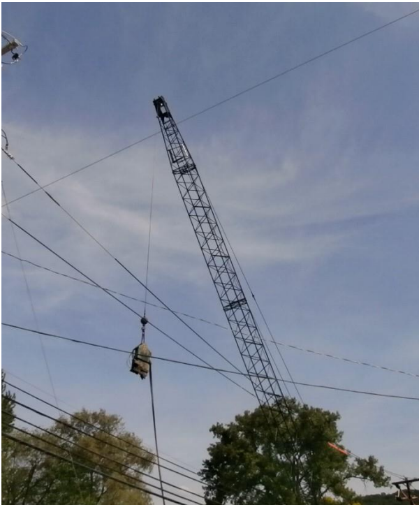
Photo 3. The crane had only one load line that was holding the pile driver. The auxiliary hoist was never rigged.