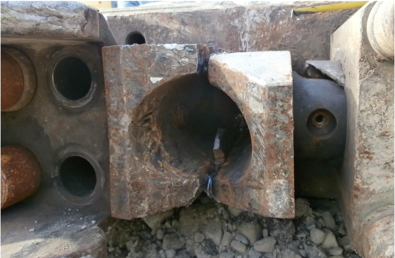
Photo 7. The bolt holes of the broken bolts and clamp areas of fixed and movable jaws of the hydraulic clamp. Both the fixed and movable jaws have two clamp areas with teeth. The jaws were mis-aligned.

New York State Department of Health • Bureau of Occupational Health and Injury Prevention Empire State Plaza-Corning Tower, Room 1325 • Albany, NY 12237 • 866-807-2130 www.health.ny.gov/environmental/investigations/face/index.htm