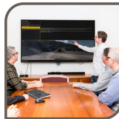
Education and Training