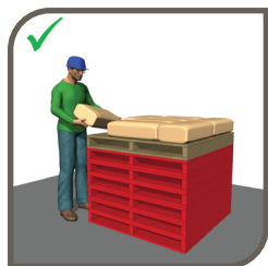
Ergonomics and Musculoskeletal Disorder Prevention