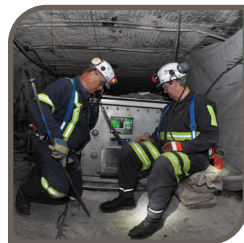
Refuge Alternatives and Emergency Response