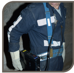
Respirable Dust Monitoring and Control