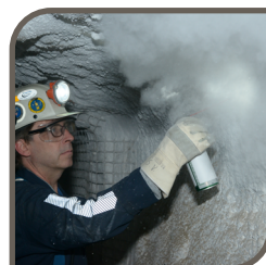
Fire and Explosion Prevention