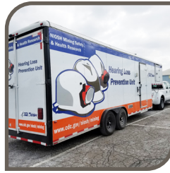
Hearing Loss Prevention