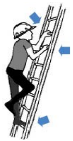
Three-point ladder safety rule

Animals were involved in one out of every five injuries to youth on racial minority-operated farms; 80% of animal injuries were horse-related.