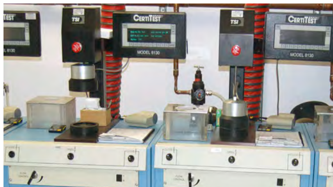
NIOSH certification lab equipment

Markings on a NIOSH-approved filtering facepiece respirator may appear on the facepiece itself or on the straps and include the elements shown below. If a filtering facepiece respirator has approval markings but is not on the NIOSH table of approved filtering facepiece respirators , it is likely to be either a counterfeit product or a respirator that has had its certification revoked or rescinded by NIOSH. If there is no TC number on the respirator's packaging, the user instructions, or the product itself, it is not NIOSH-approved. If you are unsure of your respirator's approval status, you can call NIOSH at 412-386-4000.