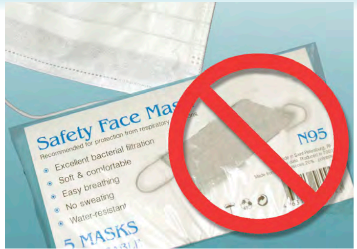
FALSE N95 CLAIM: This product had no NIOSH marking, but is labeled N95. When tested, this product did not meet N95 filtration performance requirements.