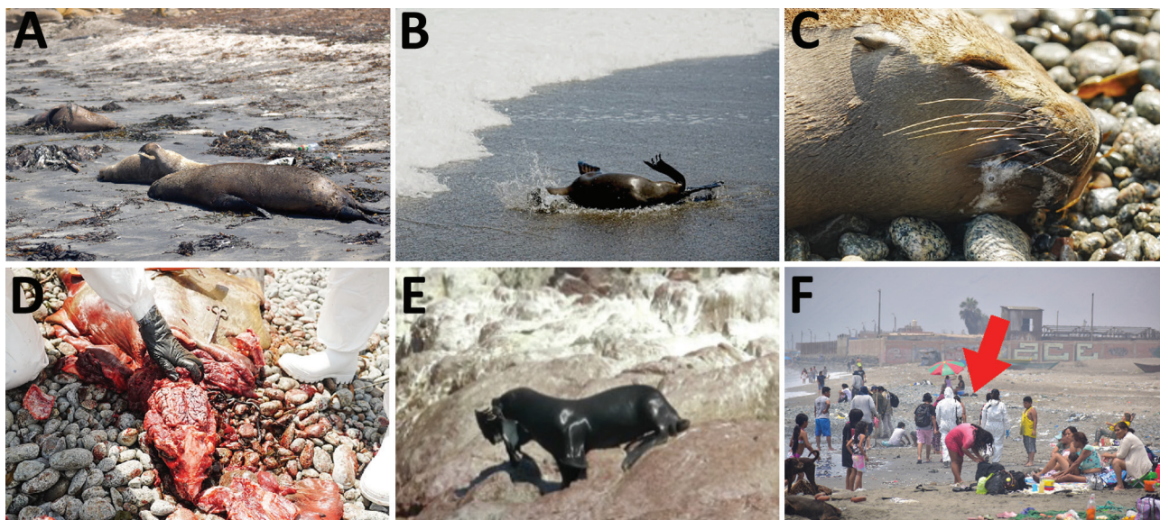
Figure. Sea lion deaths and investigation associated with outbreak of highly pathogenic avian influenza A(H5N1) in Paracas National Reserve, Peru, on the coastline, February 2023. A) Sea lion carcasses on the beach. B) Dying sea lion with ataxia. C) Dead sea lion with avian influenza clinical signs (whitish secretions). D) Sea lion necropsy showing a congestive brain. E) Sea lion trapping and eating a sick guanay cormorant, January 23, 2023. F) Field work sampling on a beach with a large number of bathers in the surroundings of infected carcasses. Red arrow indicates study staff wearing health protection equipment conducting field survey.

Further research is required to confirm the HPAI H5N1 virus as the main factor affecting the sea lions and to address the transmission pathway in this social species. We call for more attention to human–infected animal interaction in this geographic region (Figure, panel F) to identify any rise in infections and prevent a new pandemic.