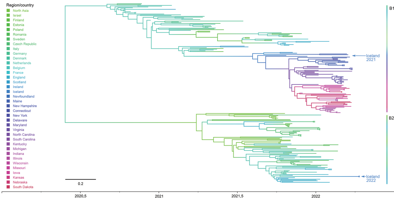
Figure 2. Phylogeographic tree of highly pathogenic avian influenza viruses. Taxa are colored according to their country of origin, and countries are arranged in geographic order from east to west. Arrows indicate viral genomes during 2021 and 2022 in Iceland and assigned to different hemagglutinin clusters B1 and B2. Method hints and basic data are presented in Hassan et al. (13). Scale bar indicates nucleotide substitutions per site.

The massively extended circulation in space and time of recent HPAIV H5N1 clade 2.3.4.4b viruses in migratory wild birds in the North Atlantic will further threaten endangered species. Grossly increased mortality rates for colonies of northern gannets and several tern species are being observed at several breeding sites throughout the North Atlantic (Figure 2). The most recent incursion of these viruses into wider palearctic areas of the Atlantic will inevitably lead to viral contamination of northern breeding habitats where ambient conditions prevail that are considered favorable for a prolonged retainment of viral infectivity outside avian hosts (23,24).