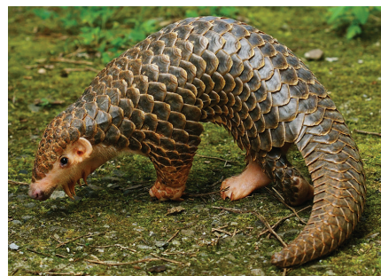
Figure. Covered in tough keratin scales interspersed with strands of fur, the pangolin, also known as a scaly anteater, assumes an impenetrable rolled-up position when threatened. Note the short muscular forelimbs. Pangolins are endangered and World Pangolin Day is the third Saturday in February. Photo of a young Chinese pangolin ( Manis pentadactyla ) by Te-Chuan Chan (Taipei Zoo, Taiwan) and Wen-Ta Li (Pangolin International Biomedical Consultant Ltd., Taiwan)

Linnaeus named the genus Manis , derived from manes , Latin for “spirits” or “ghosts or shades of the dead,” which refers to their noncuddly reptilian persona and solitary nocturnal foraging. Covered by keratin scales, pangolins, when threatened, assume a rolled up position, described by the Malay word pengguling (one who rolls up). Native to Java (thus javanica ), their habitat includes Southeast Asia, especially the Indomalayan archipelago and Sunda Islands. Humans hunt pangolins for their meat, consume their blood as an elixir, and use their scales and other body parts as ingredients for crafting leather products and nonefficacious medications.