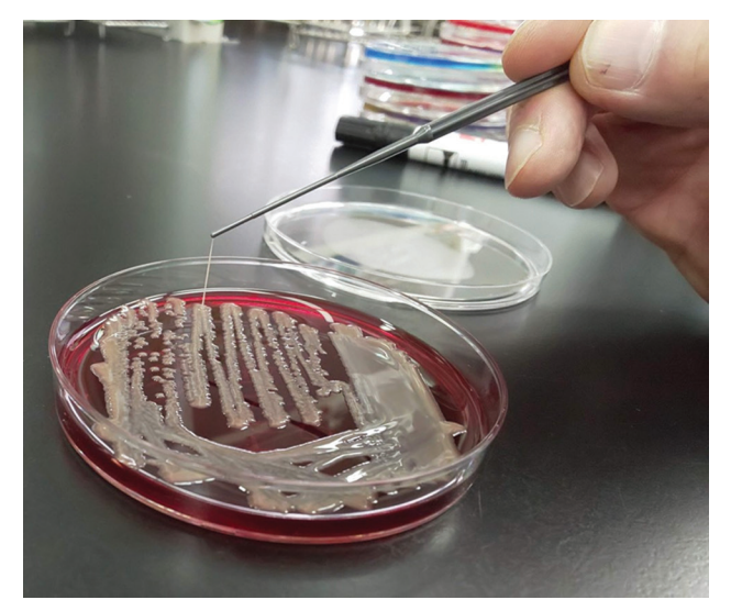
Figure 2. Positive string test result for Klebsiella pneumoniae isolate from blood of patient with coronavirus disease and fatal superimposed hypervirulent Klebsiella pneumoniae K2 sequence type 86 infection, Japan, 2020.