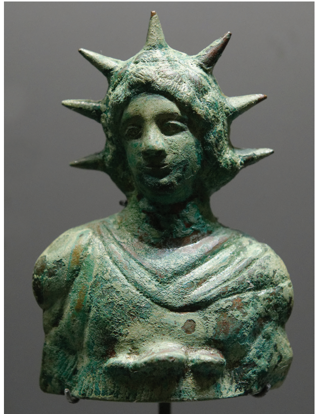
Figure 1. Bust of Helios, radiate (seven rays), with long hair, wearing a chlamys, a short cloak worn by men in ancient Greece. 1st century CE. Public domain image by Marie-Lan Nguyen. Holding institution: Louvre Museum, Paris, France.

In ancient Rome, the linkage between the power of rulers and the power of the sun was also frequently depicted on coinage. For example, a sovereign wearing a radiate crown on the front (obverse) of the coin and a personification of the sun also wearing a radiate crown and sometimes driving a quadriga on the back (reverse) was common. Figure 2 is an example of such coinage from 274 CE, featuring the emperor Aurelian wearing a radiate crown on the obverse, and, on the reverse, a personification of the official sun god of the later Roman Empire, the Sol Invictus (Unconquered Sun), also wearing a radiate crown. In the modern era, positive artistic depictions of liberty