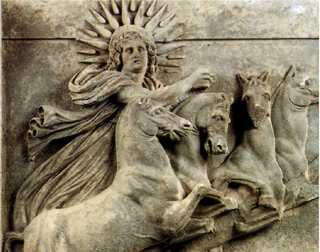
Artist Unknown. Relief showing Helios, sun god in the Greco-Roman mythology (detail) (c.390 BCE). Marble. 33.8 in × 33.9 in × 8 5/8 in/85.8 cm × 86.3 cm. Holding institution: Pergamon-Museum, Berlin, Germany.