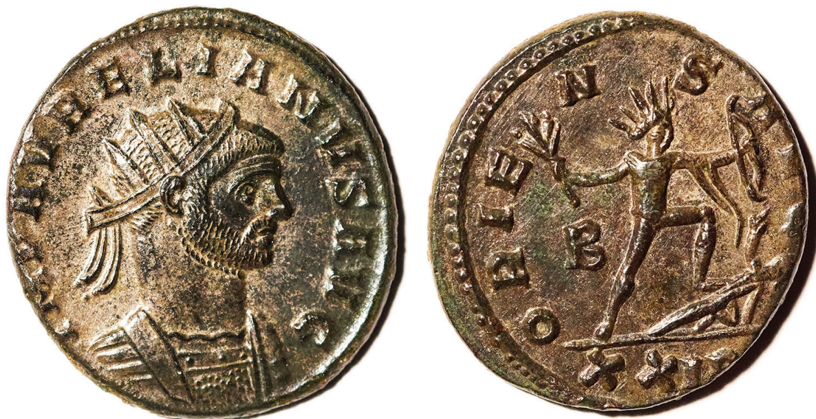
Figure 2. Antoninianus (2 denarii silvered bronze coin) of the Roman emperor Aurelian, 274–275 CE. Obverse: IMP AVRELIANVS AVG [Emperor Aurelian Augustus]. Crowned and cuirassed bust of Aurelian facing right. Reverse: ORIENS AVG [Eastern (rising) sun Augustus]. Crowned figure of Sol Invictus [Unconquered Sun] holding laurel branch and bow, stepping on conquered enemy. Private collection, Atlanta, Georgia.

epithelium and other tissues; the fusion unit mediates the subsequent fusion of the virus with endothelial cell membranes.