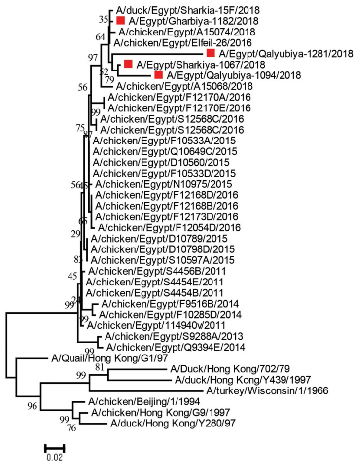
Appendix Figure 1. Phylogenetic analysis of the hemagglutinin gene of H9N2 viruses from infected cases (red squares). Those viruses belonged to G1-like viruses endemic in Egypt