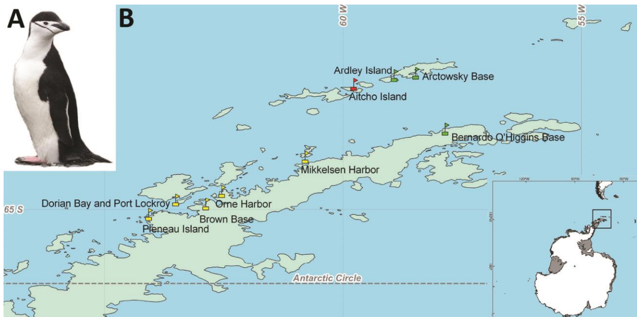
Technical Appendix Figure 1. Low pathogenicity avian influenza virus (AIV) (H5N5) found during penguin sampling of 9 locations on the Antarctica Peninsula. A) Chinstrap penguin, the species from which the novel influenza A (H5N5) virus strain was obtained. B) Antarctic Peninsula. Colored flags indicate sample type: green, serum samples; yellow, cloacal swab samples; red, virus-positive swab samples.