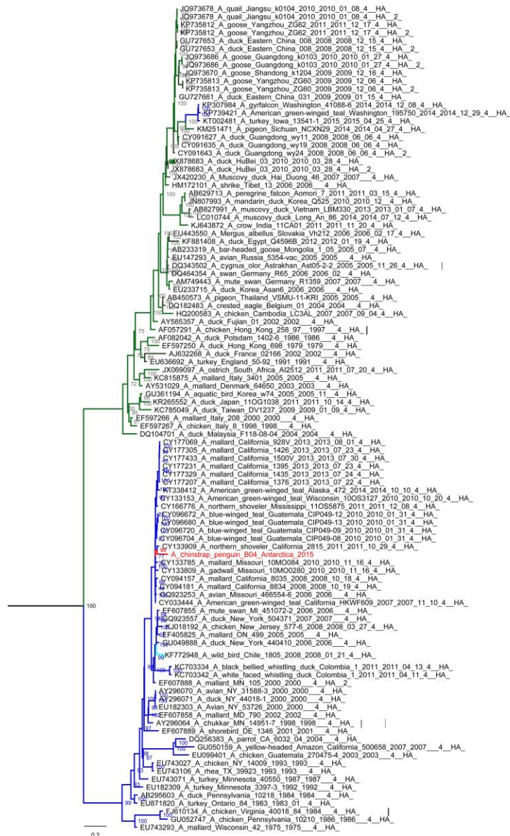
Technical Appendix Figure 2. Phylogenetic analysis of hemagglutinin (HA) gene segment obtained from chinstrap penguin in Antarctica in 2015 reveals a North American origin. HA gene A/chinstrap/Antarctica/B04/2015 (GB:KX458007; in red) clusters within the low pathogenicity North American H5 lineage. Sequences were selected from public databases to cover a wide diversity of AIV strains from different years and geographic locations and aligned with MUSCLE. The maximum-likelihood tree of 325 HA nucleotide sequences was constructed with MEGA6 and IQ-TREE on the IQ-TREE web server ( http://www.cibiv.at/software/iqtree/ ) by using the maximum-likelihood method with 1,000 ultrafast bootstrap replicates. The best-fit model of substitution was found by using the auto function on the IQ-TREE web server and Akaike information criterion. Scale bar indicates nucleotide substitutions per site. AIV, avian influenza virus; HA, hemagglutinin.