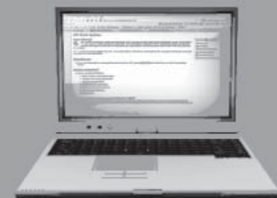
Table of contents Podcasts Ahead of Print Medscape CME Specialized topics