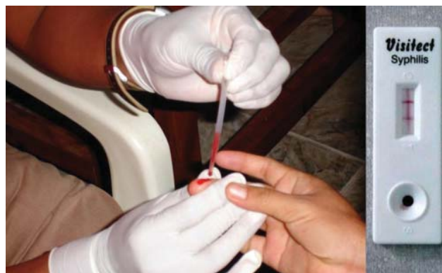
Figure 1. Rapid point-of-care syphilis test. Finger prick (left); diagnostic cassette with test bands results (right).

Most staff (10/12) thought training was satisfactory, and 9/12 reported test instructions as “perfectly easy” or “very easy” to follow. Laboratory technicians (2/2) found the test easy to use and interpret, requiring only ≈2 minutes to perform. In contrast, 2/10 physicians and nurses found interpretation of the test results “complex” or “not easy” because the test sometimes yielded a blurred result line difficult to assess and because the test could react and turn positive after the expected reading time (15 minutes). Most physicians and nurses (6/10) lacked confidence in the POC test result. They correctly pointed out that the POC test did not differentiate between past-treated and recent syphilis.