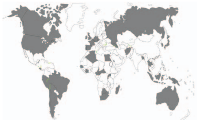
Figure 1. Shading indicates 48 countries that submitted at least 1 isolate to participating Supranational Reference Laboratories, 2000–2004. See Table 4 for complete list of participating countries.

A standardized reporting form requested anonymous data for all isolates tested for resistance to \geq 3 second-line drug classes during 2000–2004. Data were abstracted from the records, electronic or paper, depending on laboratory practices for data management. Results were submitted for 1 isolate per patient. Because SRLs rarely receive multiple isolates from the same patient, reporting of the same patient more than once was unlikely (B. Metchock and